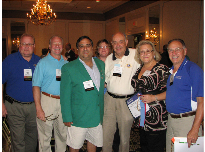
East Boston Kiwanis Club received Newsletter award!