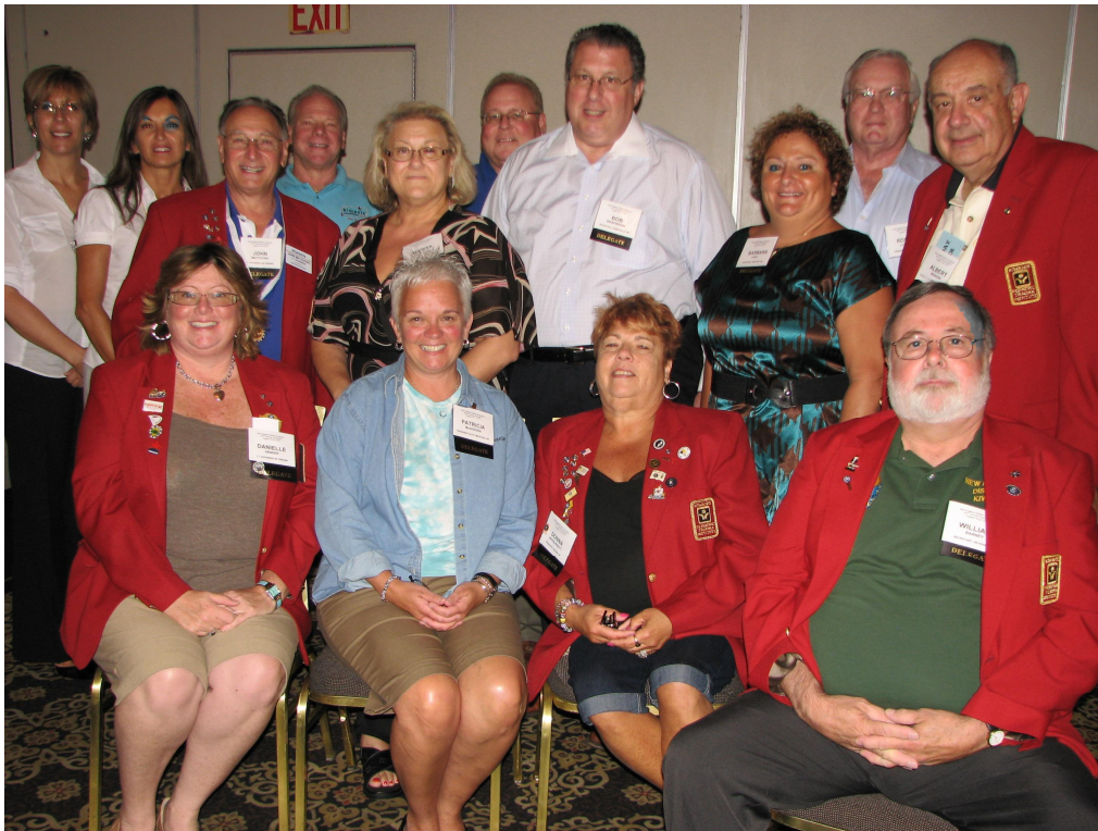
New England Kiwanis Division 14 delegates from every club!